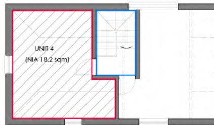
First Floor Unit 4 NIA = 18.2 sqm / 196 sqft